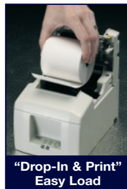
"Drop-In & Print" Easy Load